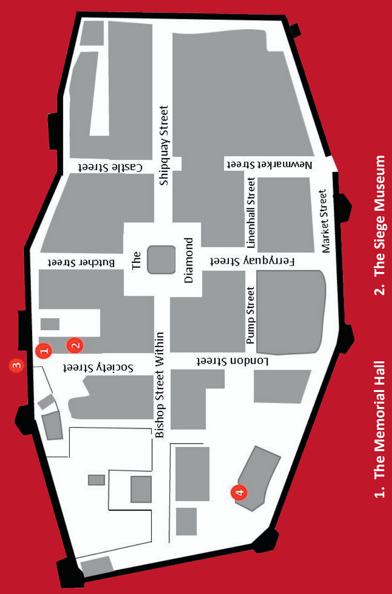
1. The Memorial Hall